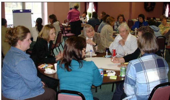
Participants at the “Greener Pastures” workshop in Sparta discuss library advocacy.

Participants spent the morning reviewing the project’s curriculum and goals, heard a summary of statewide technology programs, and received a tour of WebJunction, including technology resources such as TechAtlas (useful for creating an automated inventory) and TechSoup (technology assistance for nonprofits, as well as free or discounted software).