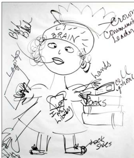
Drawings representing the ideal characteristics of public library advocates added some whimsy to the process of building support for libraries.